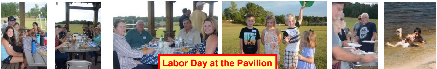
Labor Day at the Pavilion

We will continue to look for opportunities to enjoy the art of flowers, the study of nature, and the pleasure of creating a garden, even as we respect the health and safety concerns of the moment. If you have questions or suggestions, or if you are interested in learning more about the garden club, contact Nancy.