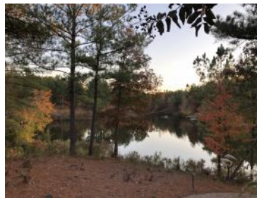
Fall on the Lake