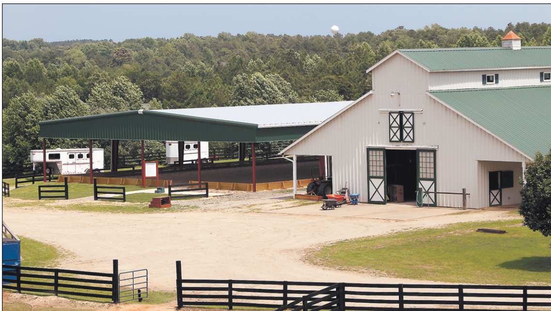
McLendon Hills' new covered riding arena is positioned in back of the Equestrian Center's distinctive horse barn

screenings, topped off with a mixture of sand and a felt- (Continued on page 9)